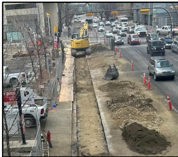
Telus duct bank installation along 4 Ave SW