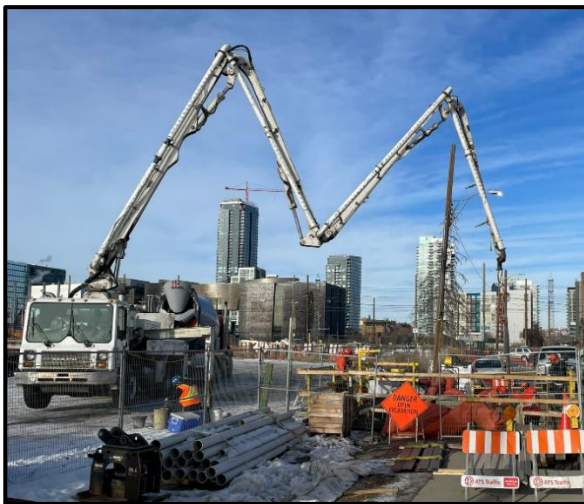
Enmax vault installation in Beltline East

The pictures below provide a snapshot of the ongoing third-party utility installation work in the Beltline and Downtown.